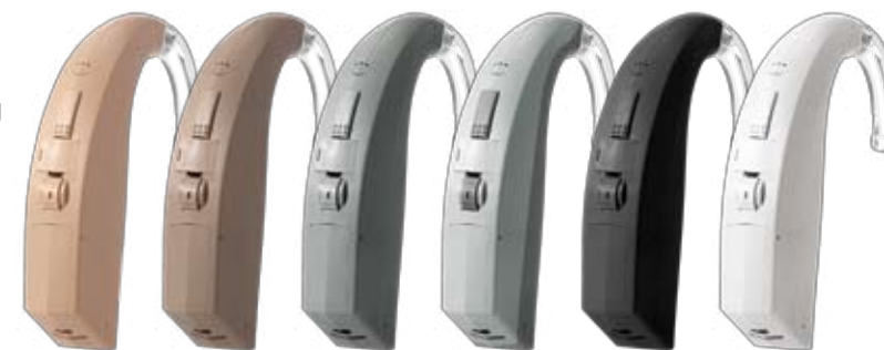
BEIGE TAUPE DARK GREY DK./LT. GREY BLACK WHITE